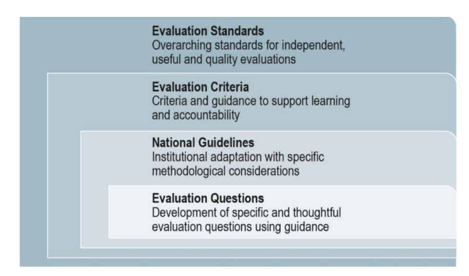
Figure 1: How the criteria fit in with other norms and standards

Back in 1991, OECD Development Assistance Committee (DAC) developed five principles for evaluation of development assistance that came to be known as Evaluation Criteria (OECD, 2010). Applying the criteria for almost 25 years and enormous global consultations, a new criterion 'Coherence' was added to the existing 5 criteria to make the definitions more nuanced and clearer. (OECD, 2019). OECD DAC Criteria has become the common-reference point for the evaluators over the years. Further, with the adoption of the SDG Agenda for Sustainable Development by 2030 and Paris Agreement within the United Nations Framework Convention on Climate Change (UNFCCC) has made this criterion more imperative in determining the effectiveness of the programs (OECD, 2021).