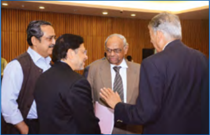
Economic Advisory Council to the Prime Minister; and Former Governor, Reserve Bank of India at IIC, New Delhi, March 13, 2015. (pics above).