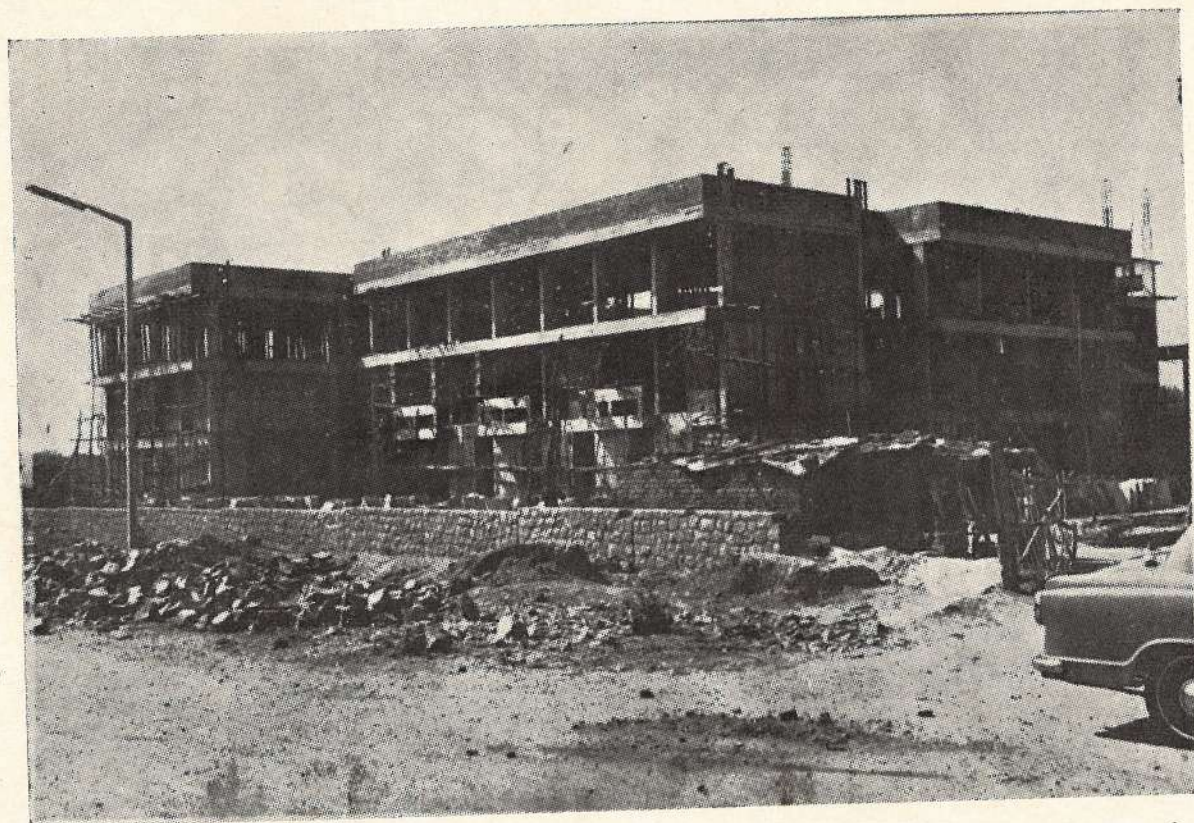
Institute's Office Complex Under Construction