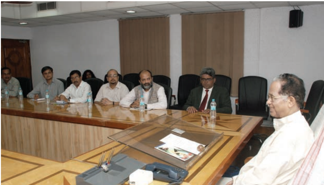
NIPFP team met Assam CM Tarun Gogoi for pre-study consultations on state finances.