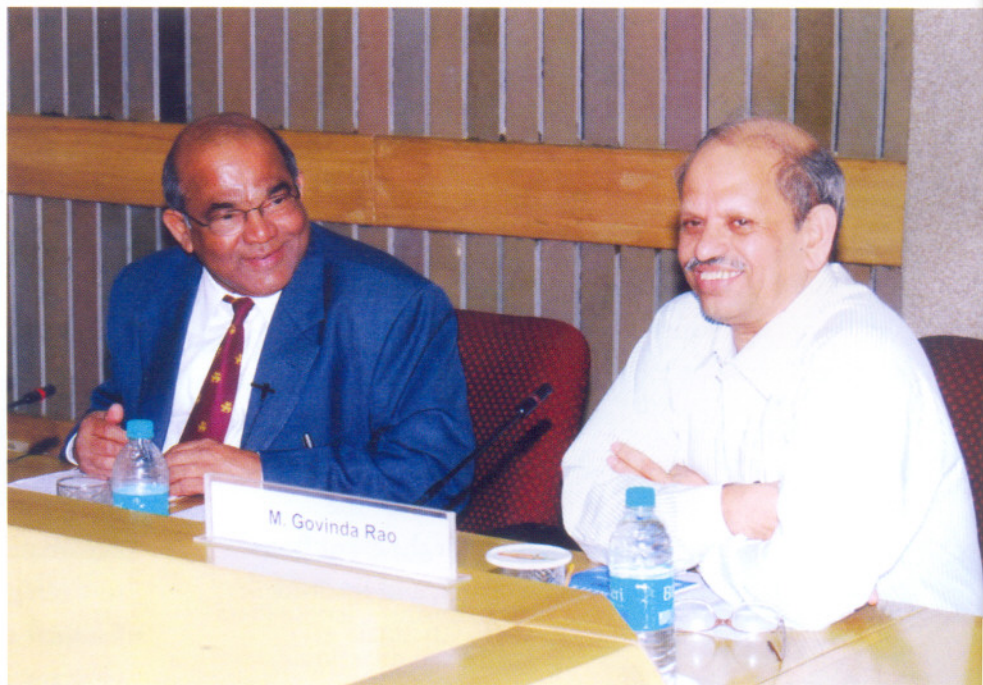
Lecture on Fiscal Policy and Economic Reforms by Y.V. Reddy, Governor, RBI