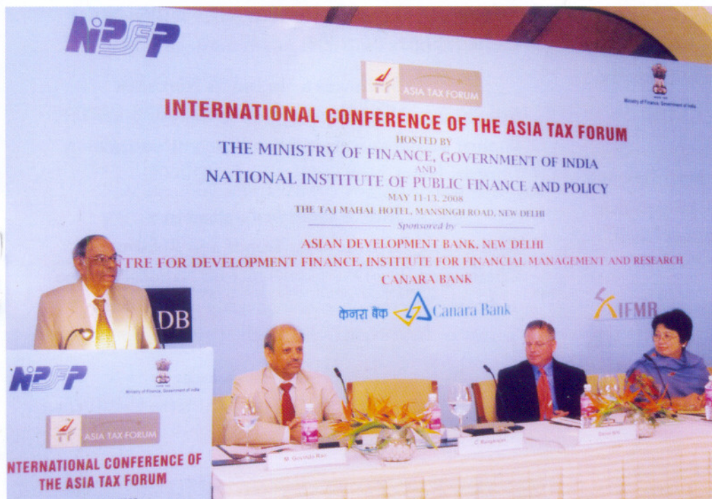
NIPFP & Ministry of Finance hosted the Fifth Asia Tax Forum

11-13, 2008, at Taj Mahal Hotel, New Delhi. The forum focused on VAT, and excise taxation. This year's forum was attended by participants from governments of 12 countries and regions, in addition to experts from 4 countries, besides private sector participants from 4 industries. The areas of discussion included issues in the introduction and implementation of VAT, with dedicated focus on VAT on financial services, benchmarking and use of tax expenditures, use of petroleum excises in environmental tax policy, and use of information technology to reduce costs in indirect tax administration and enhance data collection for policy work. The Institute received partial sponsorship for the event from Asian Development Bank, Canara Bank, and Institute of Financial Management and Research, Chennai.