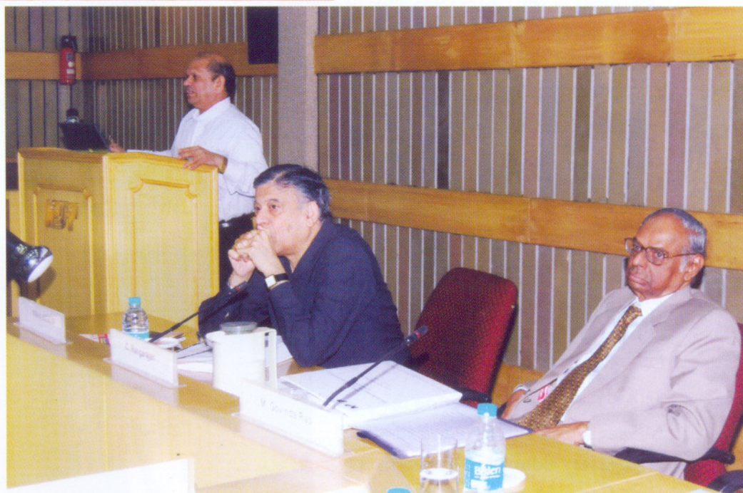
Seminar on Issues Before the Thirteenth Finance Commission

11-13, 2008, at Taj Mahal Hotel, New Delhi. The forum focused on VAT, and excise taxation. This year's forum was attended by participants from governments of 12 countries and regions, in addition to experts from 4 countries, besides private sector participants from 4 industries. The areas of discussion included issues in the introduction and implementation of VAT, with dedicated focus on VAT on financial services, benchmarking and use of tax expenditures, use of petroleum excises in environmental tax policy, and use of information technology to reduce costs in indirect tax administration and enhance data collection for policy work. The Institute received partial sponsorship for the event from Asian Development Bank, Canara Bank, and Institute of Financial Management and Research, Chennai.