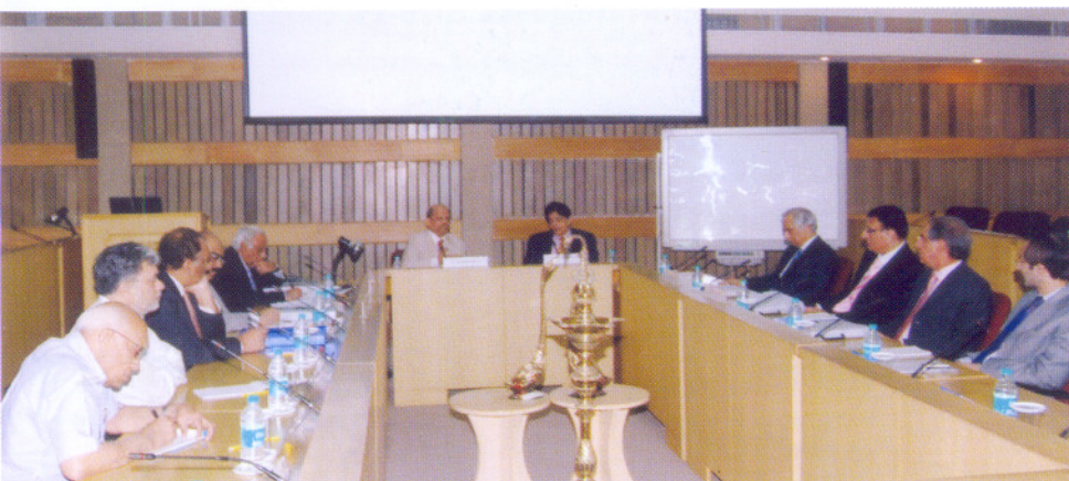
Delegation from the Planning Commission of Pakistan